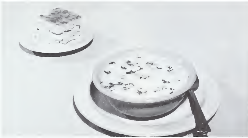
N-39866--Hearty, nutritious, satisfying cream of potato soup sporting a garnish of chopped parsley.

Cover potatoes and onion with boiling water. Add salt, cover and cook until tender. Drain potatoes and save cooking liquid. Mash potatoes or put through a sieve. Measure cooking liquid and add enough water to make 4 cups. Mix dry milk and flour, add to cooking liquid and beat until smooth. Add butter or margarine and milk mixture gradually to mashed or sieved potatoes. Cook over very low heat, stirring occasionally until slightly thickened, about 15 minutes. Makes 6 servings, approximately 3/4 cup each.